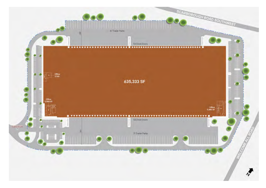
4475 South Fulton Parkway Atlanta, GA 30349